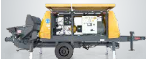
BSA 1406 E