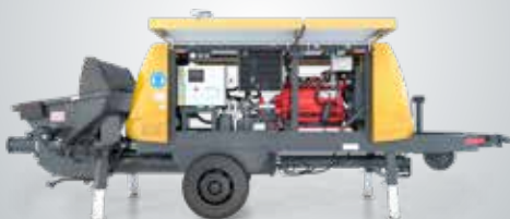
BSA 1407 HD