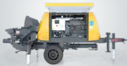
BSA 1405 D