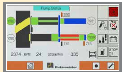
LIVE PUMPING DISPLAY