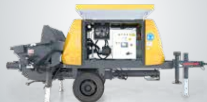
BSA 1404 E