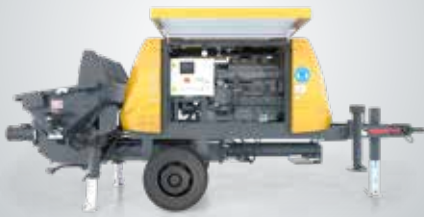
BSA 1404 HD

*Value for Hydraulic Oil fed to Piston Side