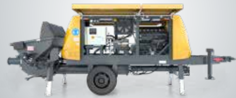
BSA 1407 D