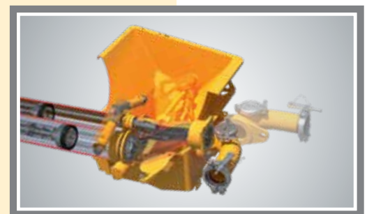
S TRANSFER TUBE