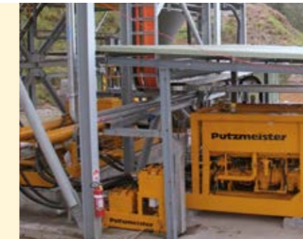
HSP 25100 HPS, PCF valves, Hydraulic Powerpack HA 400 + 400 E-SP