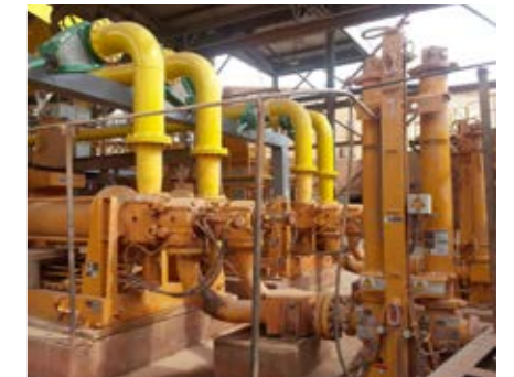
VPD system installed after a HSP piston pump for tailings handling